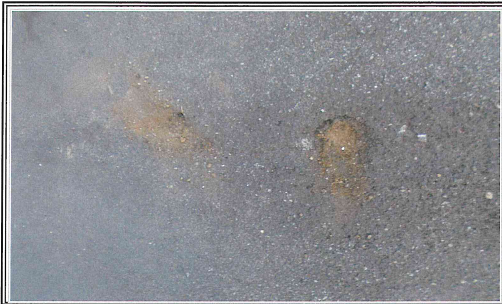
Description of Photograph #3: A view of the two (2) breaches located.