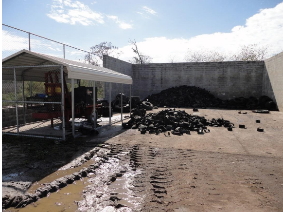
Shearer used for cutting tires