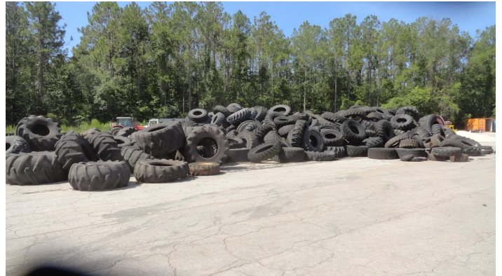
Oversized Tire Pile