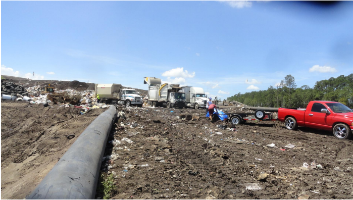
Lower Working Face Photo 2