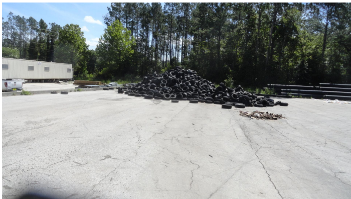
Tire Storage Area