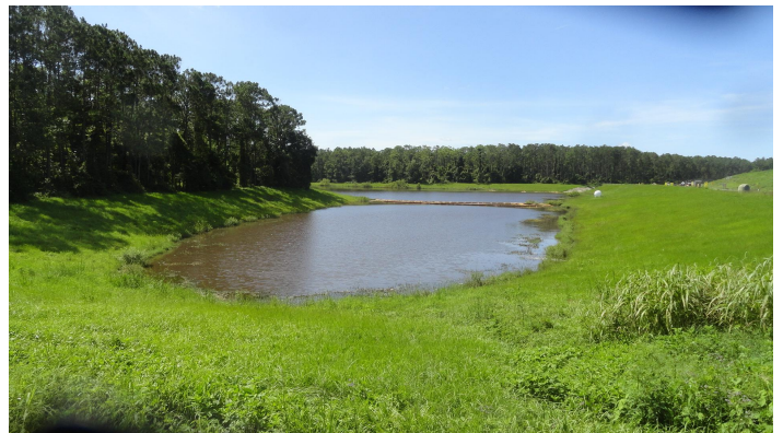
East Storm Water Pond