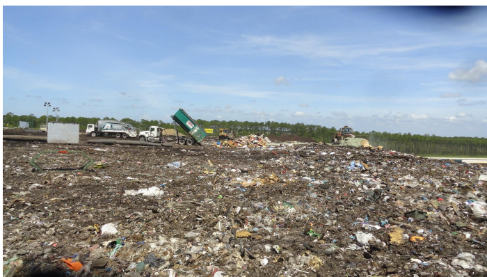
Upper Working Face