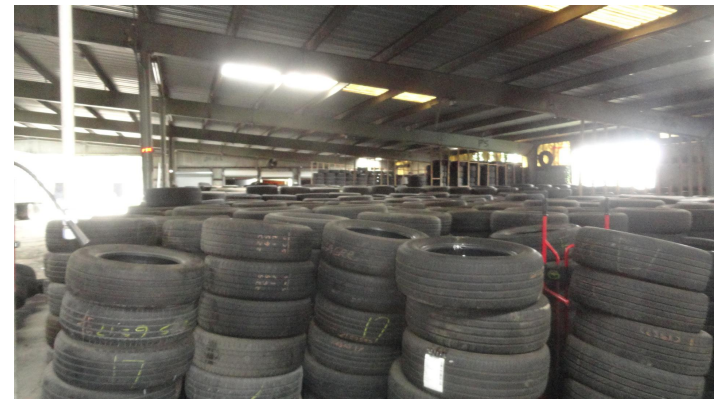
Sorted Tire Outdoor Storage