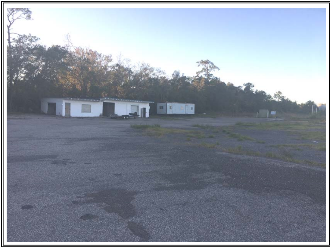
1) Facing northwest, looking at the block building and field trailer on the site. An asphalt drive is visible.