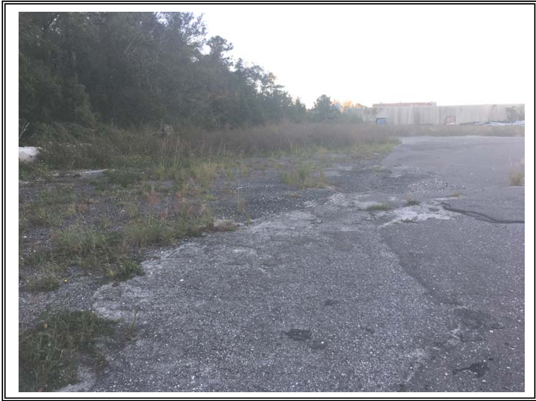
3) Facing north, along at the western portion of the site. Large paved areas are visible.