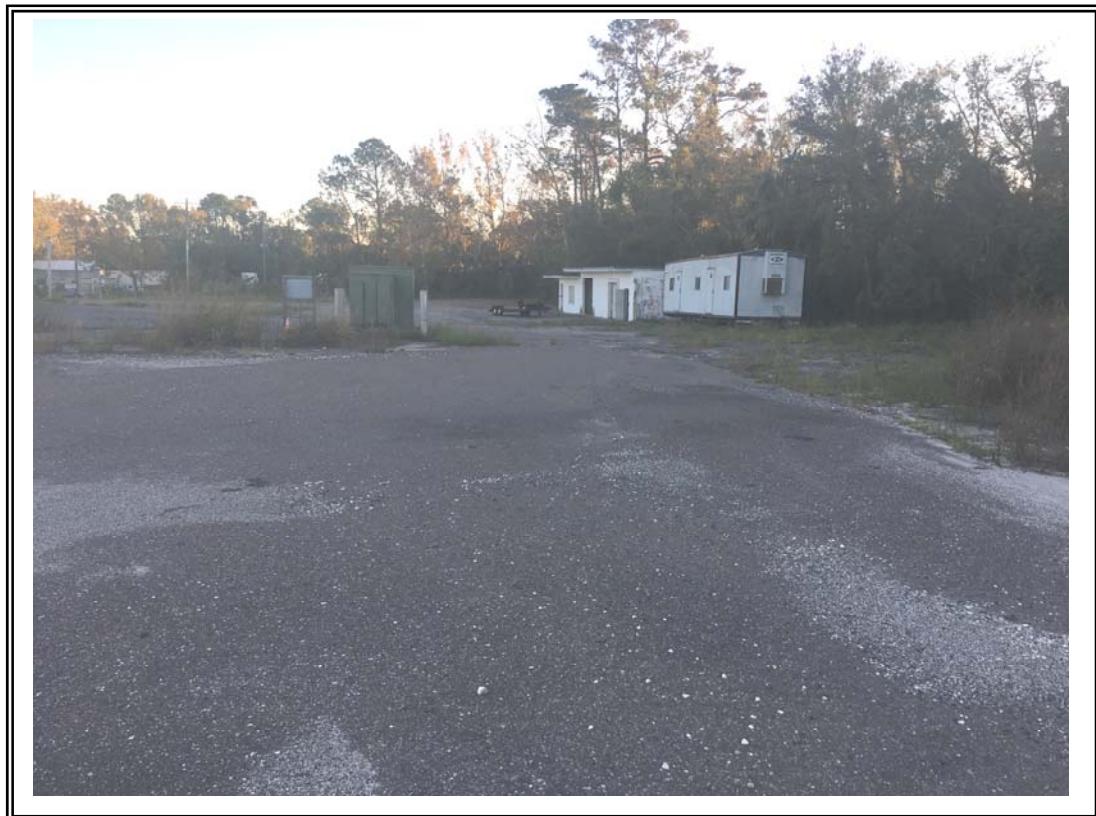
2) Facing southeast, looking at the site buildings and the western tree line. Loose gravel is visible that follows the southerly surface flow.