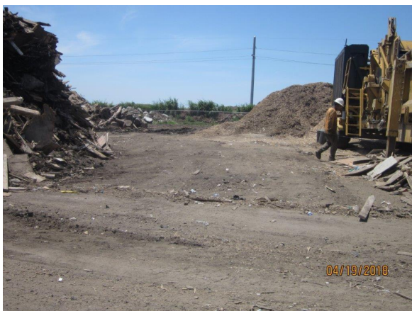
Processing Yard trash