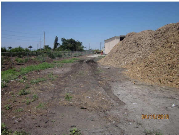
Access Road around the perimeter