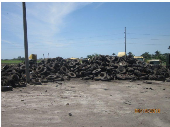
Outdoor Waste Tire Storage