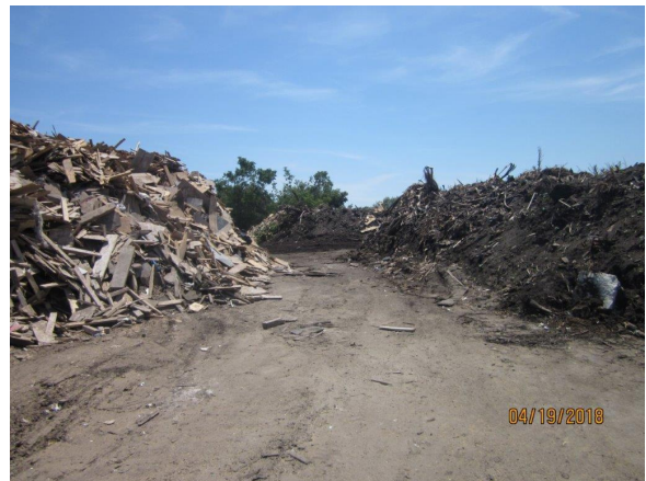
Separated Yard trash