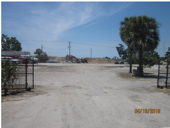
Entrance to the Facility