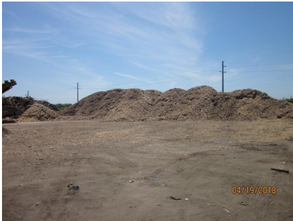
Processed Yard Trash