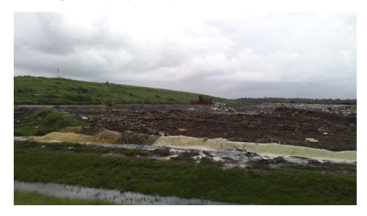
Large Working Face