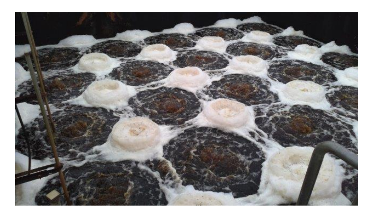
Old Treatment Plant