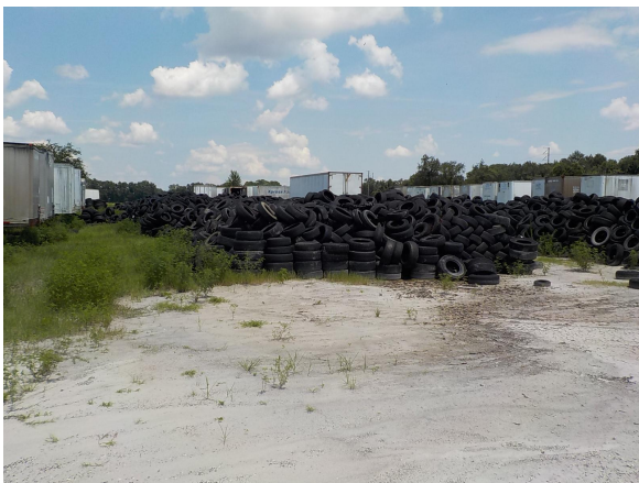
Tire Pile Cluster