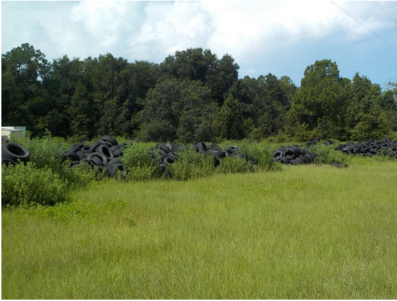
Vegetation Photo 3