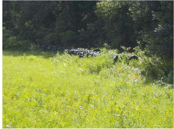
Lack of Fire Lane South Bales