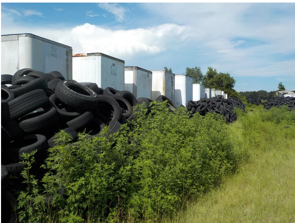
Tire Pile Against Trailers