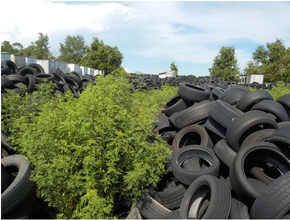
Pile Over 50' Wide Photo 1