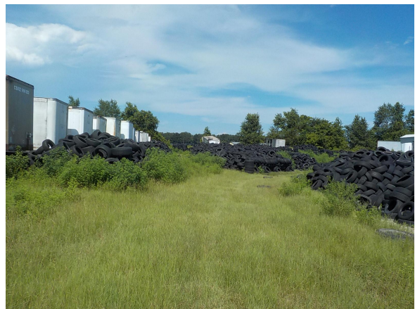
Outdoor Storage Photo 2