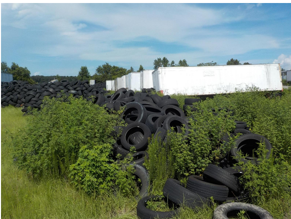
Vegetation Photo 1