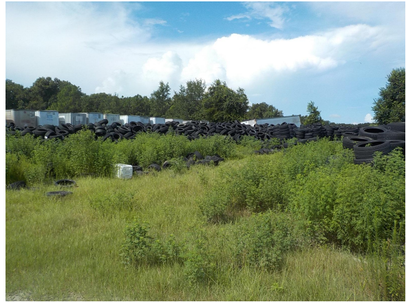
Excessive Width Photo 1