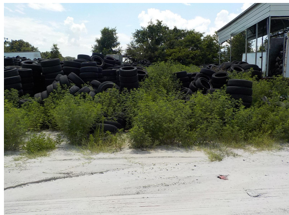
Northwest Tire Pile