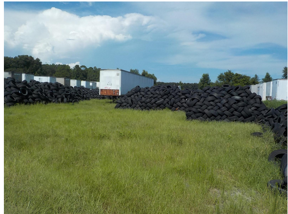
Lack of Fire Lane Access Photo 2