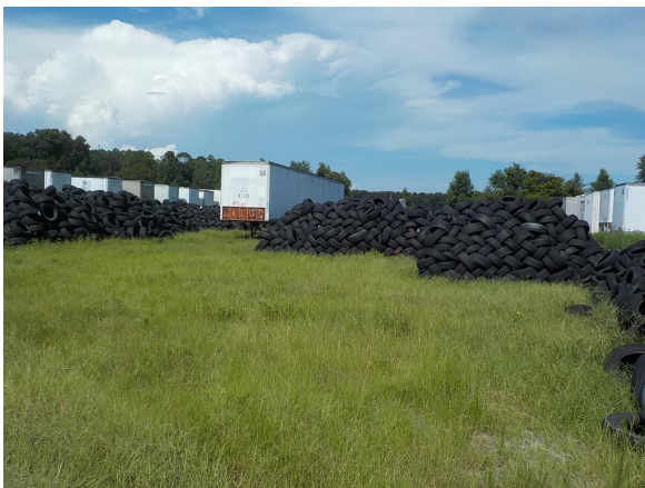
Outdoor Storage Photo 1