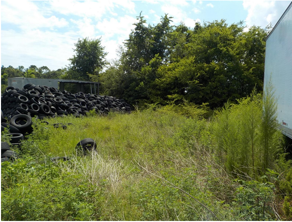
Lack of Fire Lane West Piles