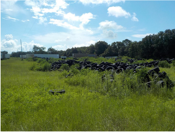
Vegetation Photo 3

This facility is a permitted Waste Tire Processor, with maximum capacity of 125,000 waste tires. The facility's business plan is to remove (cull) car and light truck tires, with resale value, from the waste stream for sale as used tires in retail and wholesale in both national and international markets. The source of the waste tires is primarily major tire retailers in Jacksonville and Ocala who contract with Liberty Tires of Jackson, Georgia for disposal of these waste tires. Liberty contracts with Advanced Tires to run these routes, providing four trucks for the route service and trailers for transport to the Jackson facility for processing/disposal. The cull rate for saleable tires from these routes is about 30%.