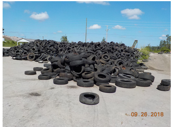
East Storm Water Pond