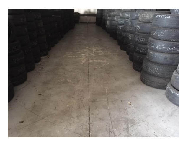
April 2019 Disposal Documentation