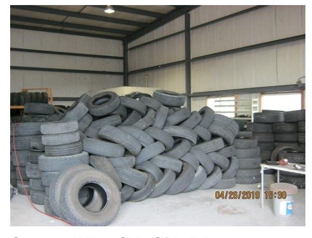
Corrected West Side Of Building