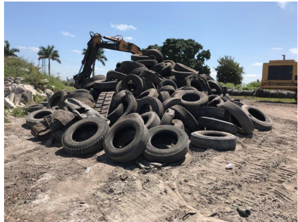
Forever Rec. Photo 4 of 10