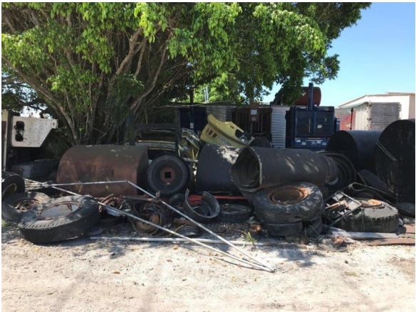
Forever Rec. Photo 9 of 10