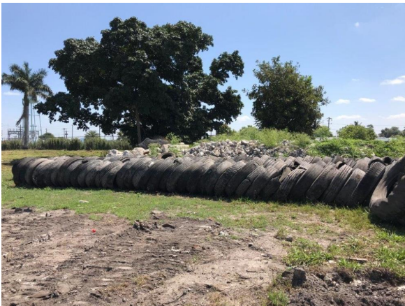
Forever Rec. Photo 5 of 10