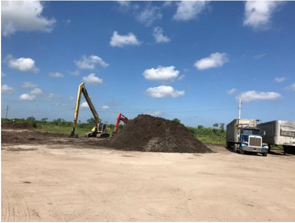
Forever Rec. Photo 1 of 10