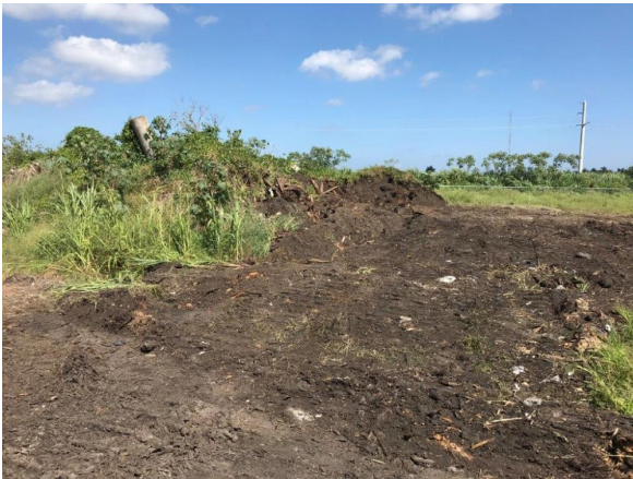
Forever Rec. Photo 3 of 10