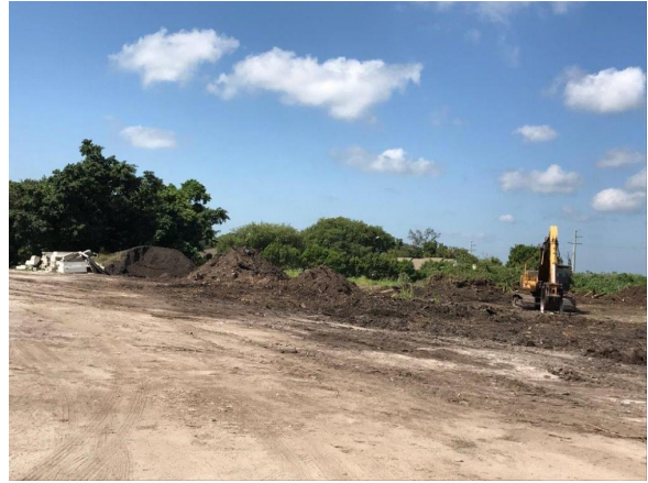
Forever Rec. Photo 2 of 10