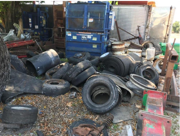
Forever Rec. Photo 10 of 10