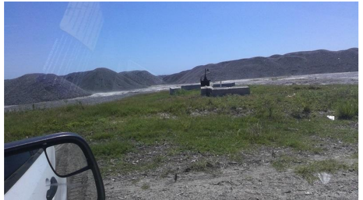
Temporary Ash Storage Project