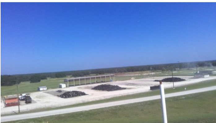
Existing Waste Tire Facility Pad