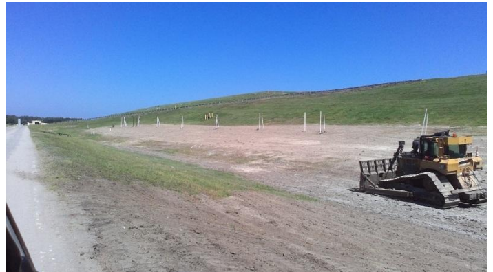
Leachate Cut-off Trench Extension