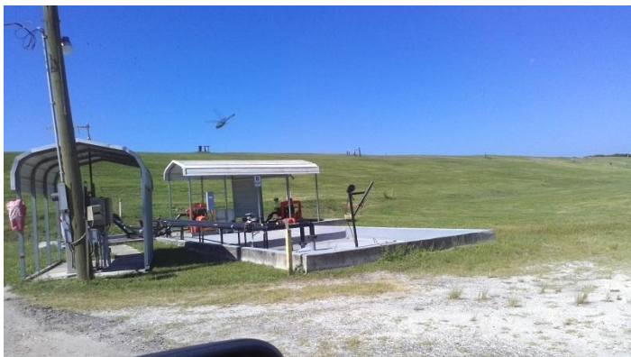
Pump Stations PS-B And PS-A