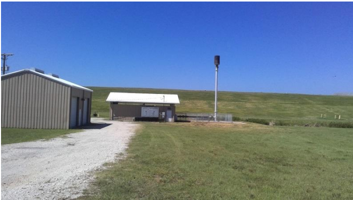
Landfill Gas Flare