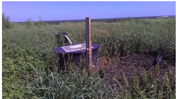
Leachate Sump For Compost Project