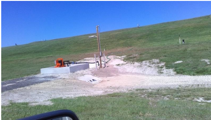
Permanent PS-2 Under Construction