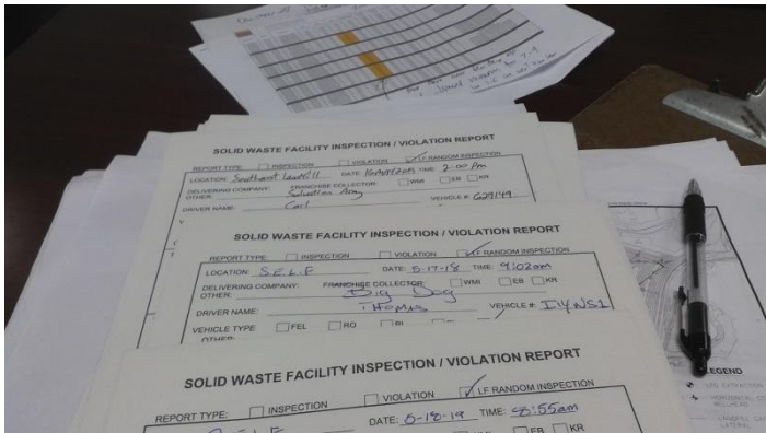
Random Incoming Load Inspections