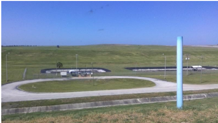
Effluent / Leachate Ponds A & B