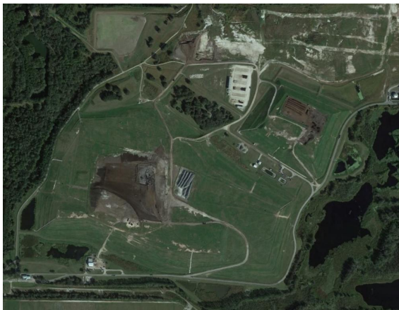
Satellite Overview Of Facility