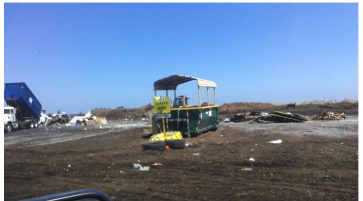
Working Face At Phase IV