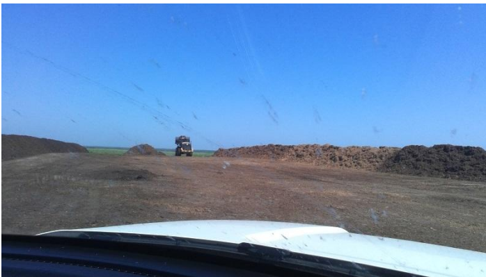
Compost Project On Sections 7-9