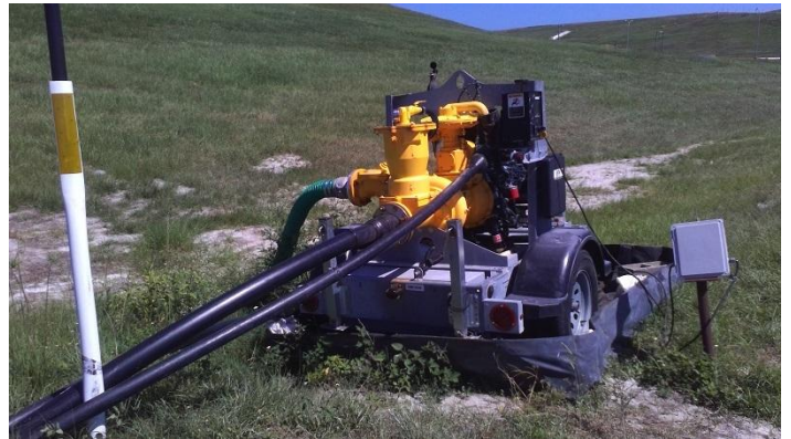
Temporary PS-2 In Use