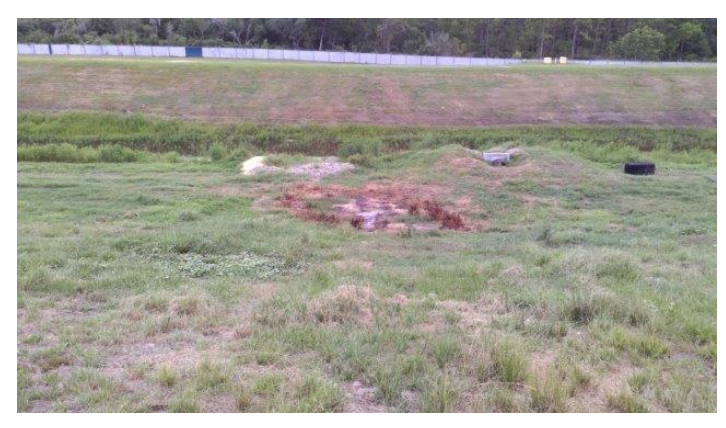
Seep on South-Facing Slope