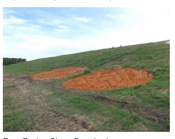
Repaired Seep on South Slope