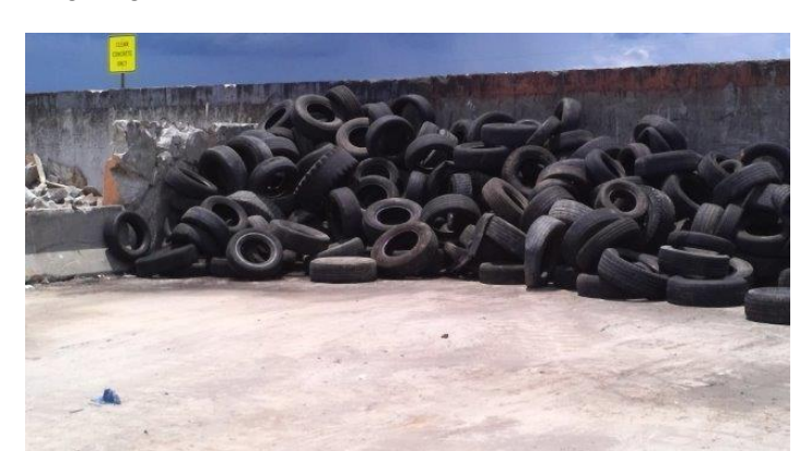
Tires With Rims