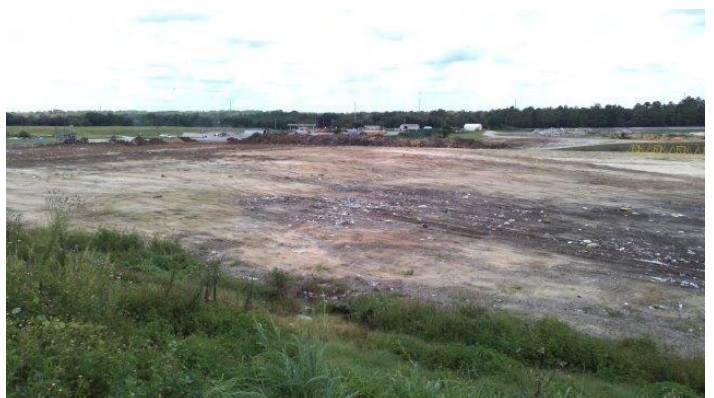
Seep on South-Facing Slope