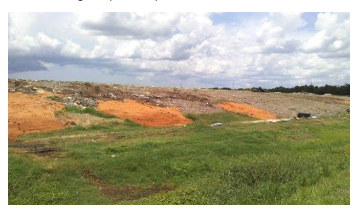
East-Facing Slope Repaired