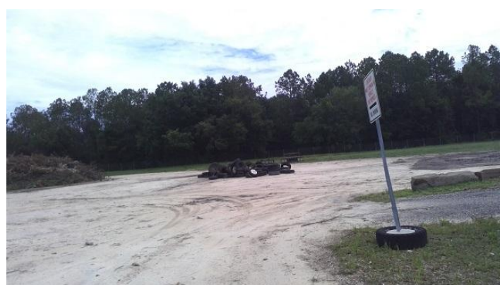
Waste Tire Area