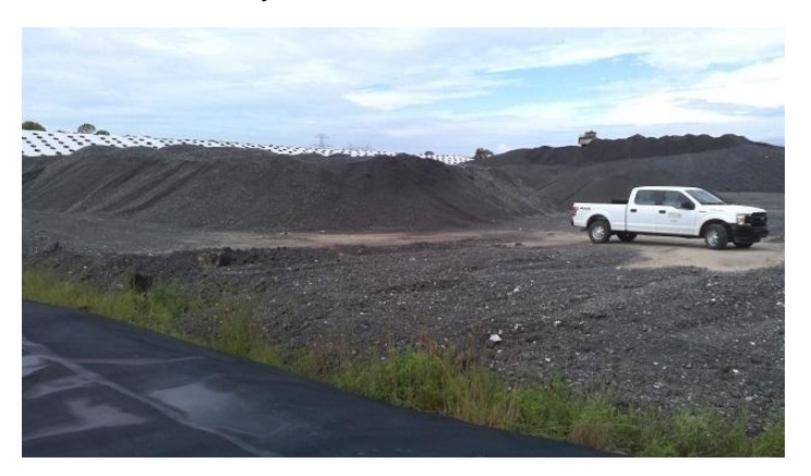
Active Face of Fly Ash Area