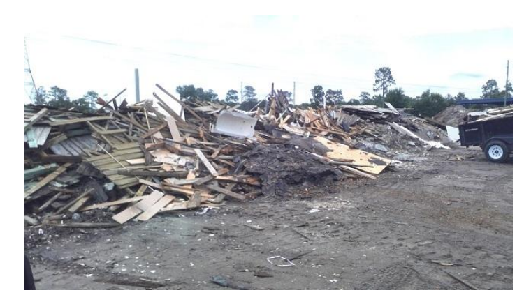
Active Face of Class III Landfill