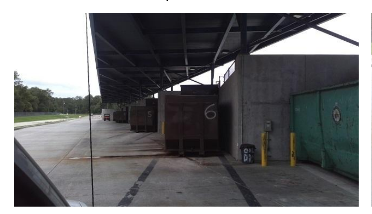
Container 6 - Leaking Leachate