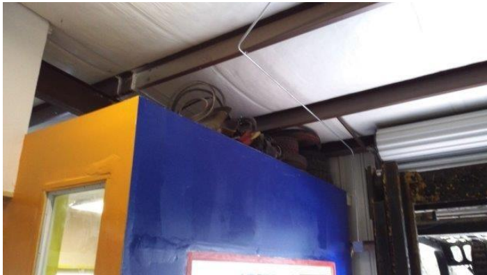
Tires Stored Too Close To Ceiling