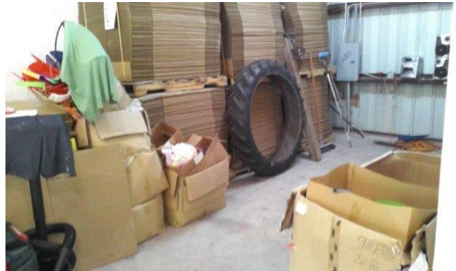
Tire To Be Processed