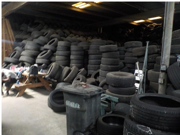
Southeast Pile Photo 1