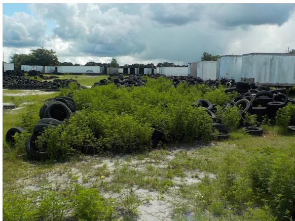
Tires in Vegetation Photo 1