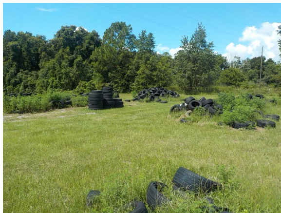
Tires in Vegetation Photo 2