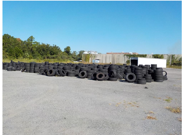
Removed for Resale