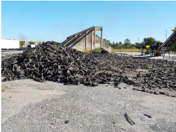
Tire Shred Pile