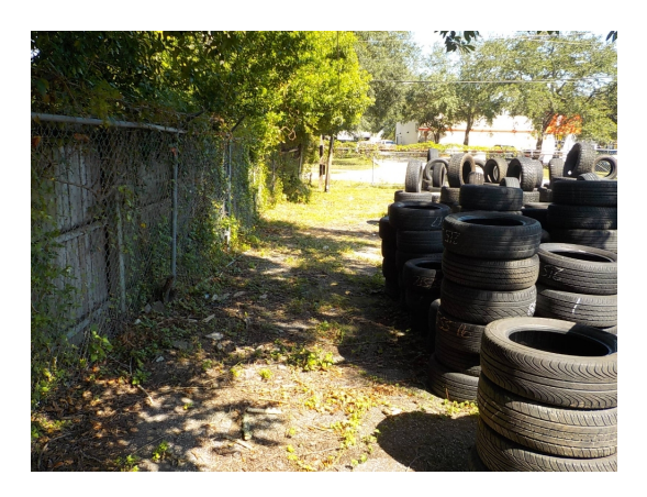
Tires for Resale