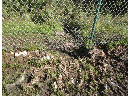
10/22 Washout near fence