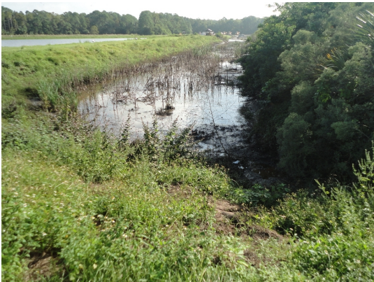
10/22 CUP between landfill/SW pond