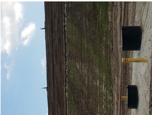
10/23 Fixed erosion on side slope