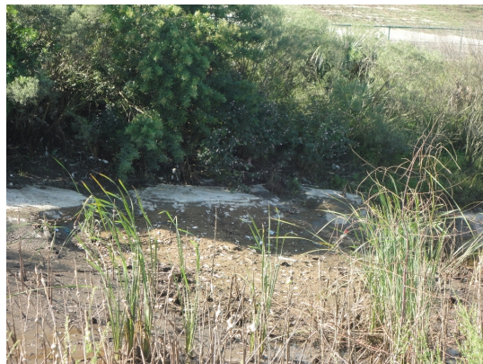
10/22 Washout into CUP