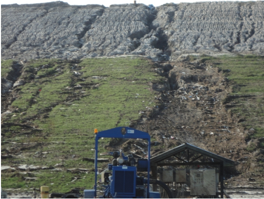
10/22 Side slope erosion