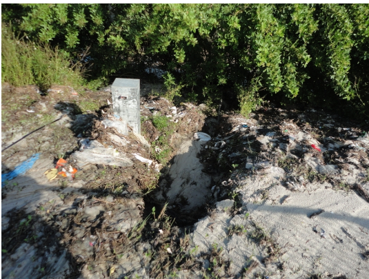
10/22 Washout near GW well