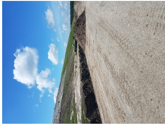
10/23 Berm (facing West)