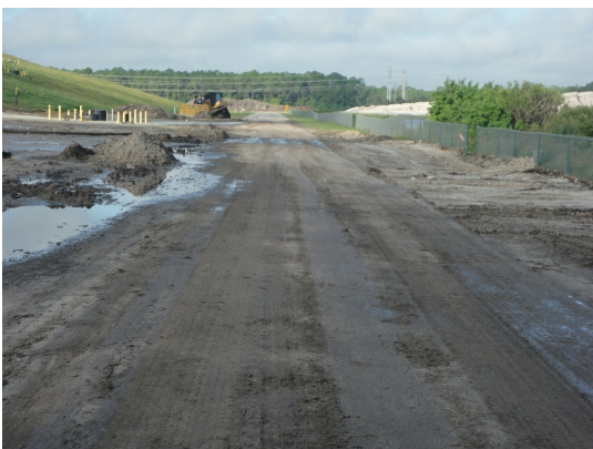
10/22 Leachate/stormwater in road