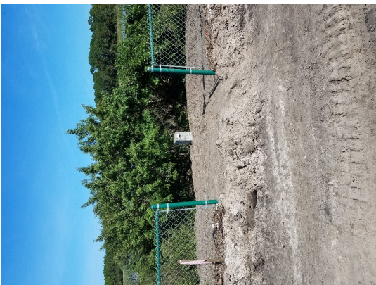
10/23 Washout covered at GW well