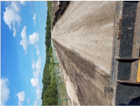
10/23 wahsout covered along fence