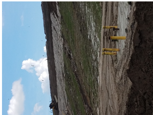
10/23 fixed erosion on side slope