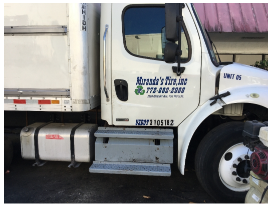
Truck in front of facility