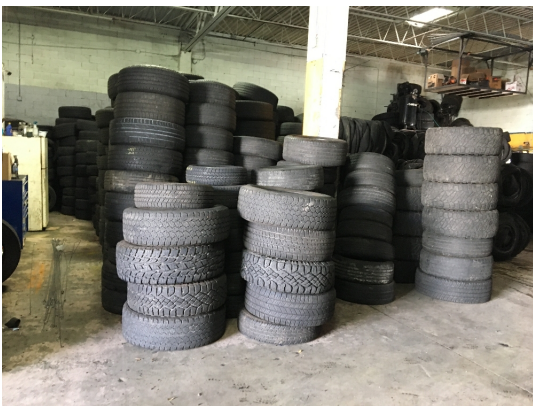
Tires in center of facility