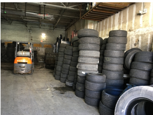
Stacked tires along west wall