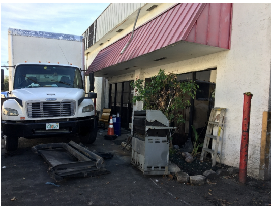
Front of facility