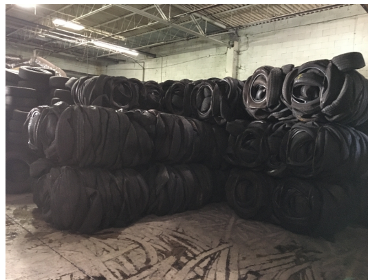
Baled tires along east wall