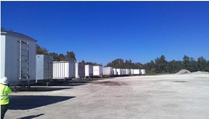
Tire Storage Trailers