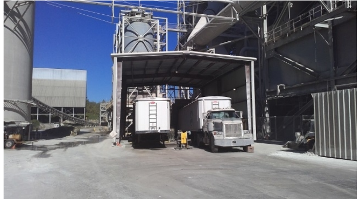
Fuel Cube Storage Area