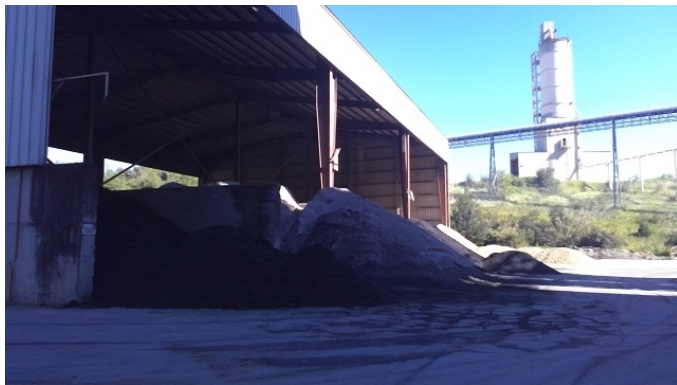
Material Outside of Building