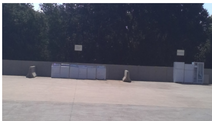
White-Good Storage Pad