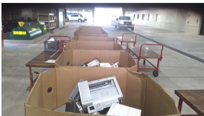
Electronic Scrap Area