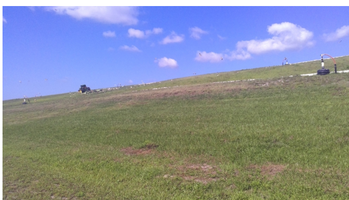
Phase II Cover