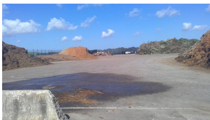
Yard Trash Area