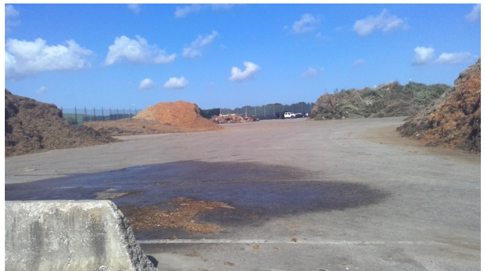
Yard Trash Area