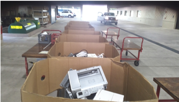
Electronic Scrap Area