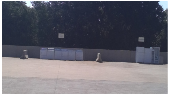
White-Good Storage Pad