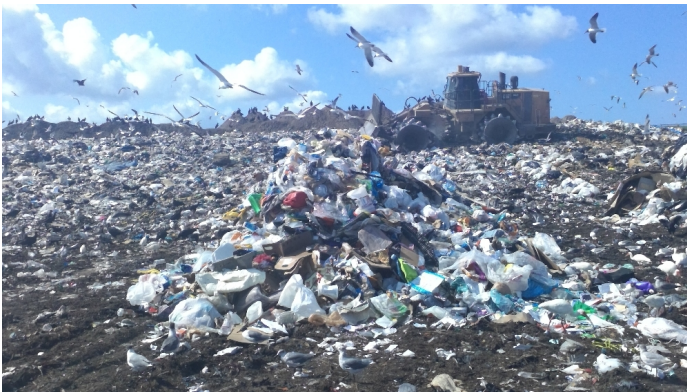
Active Working Face (Phase II)