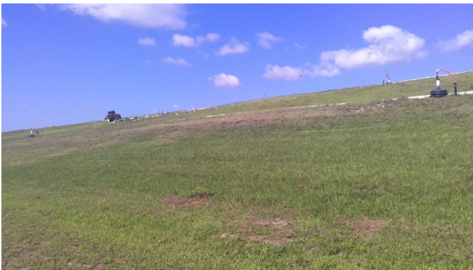
Phase II Cover