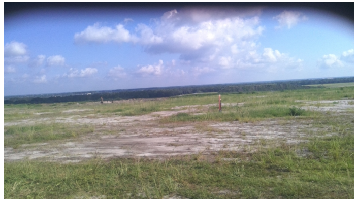
Top of Phase III