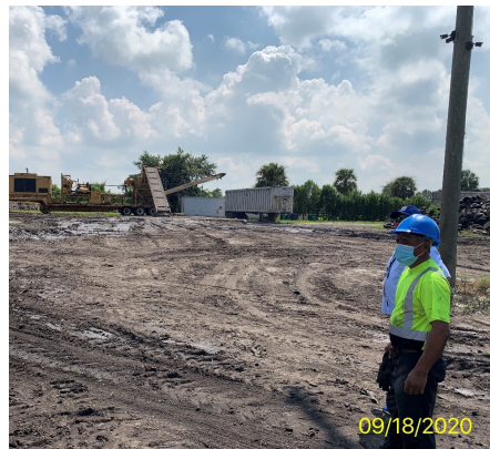
Waste Tires - 6 of 6