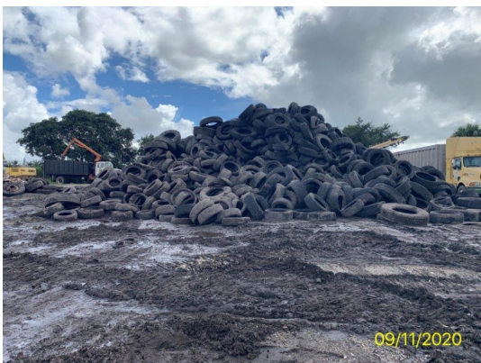
Waste Tires - 1 of 6