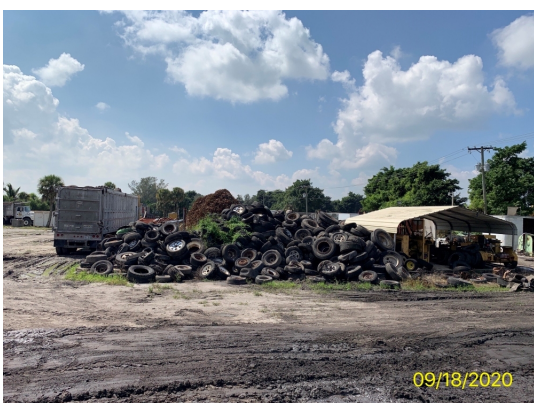
Waste Tires - 3 of 6