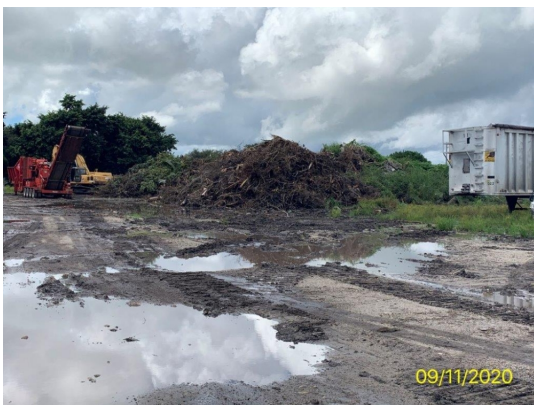
SOPF - 1 of 6