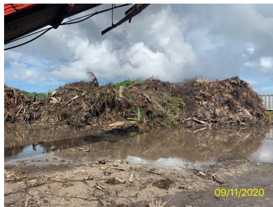
SOPF - 2 of 6