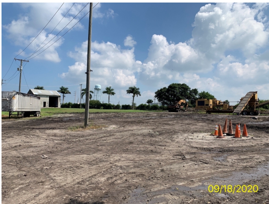
Waste Tires - 5 of 6