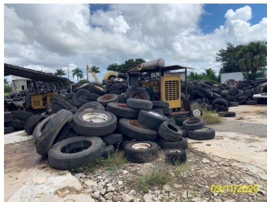
Waste Tires - 2 of 6