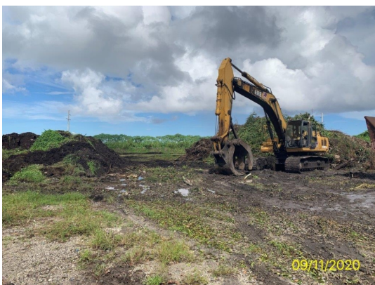
SOPF - 3 of 6