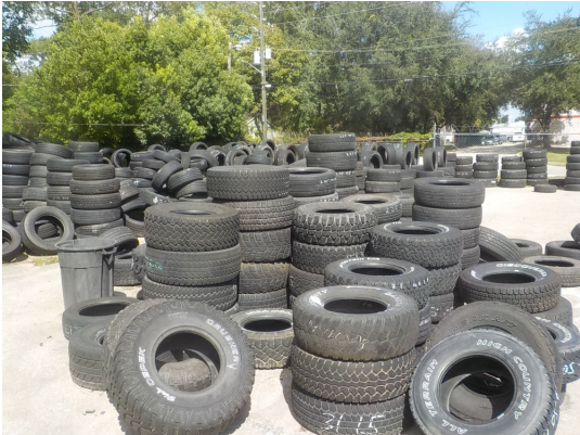
Tires for resale