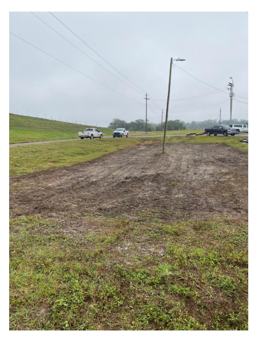
Photo 3. Completed clean soil backfill of affected area (Looking NE).