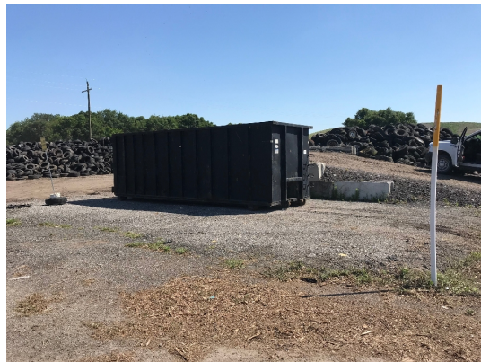
Unprocessed Tires - Post