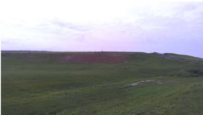
Sparse Vegetation - Phase V