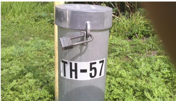
TH-57 Locked & Labeled