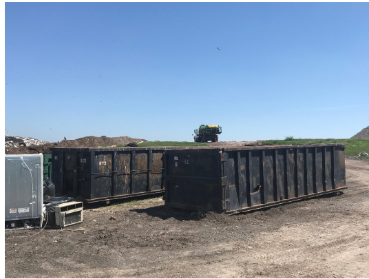
Electronic Waste Storage - Post