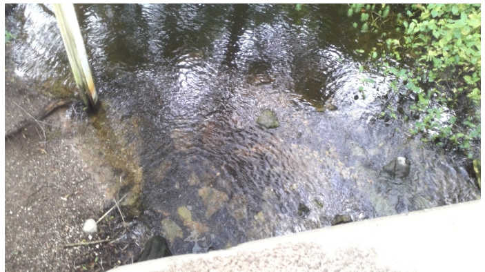
3C2 Discharge Outfall