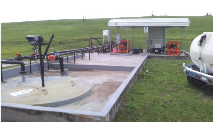
Pump Station A / B