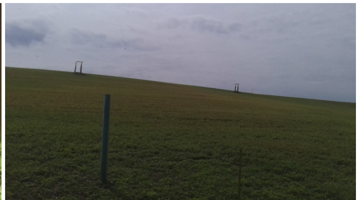
Prior Sinkhole Location