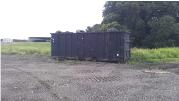
Unprocessed Tires - During