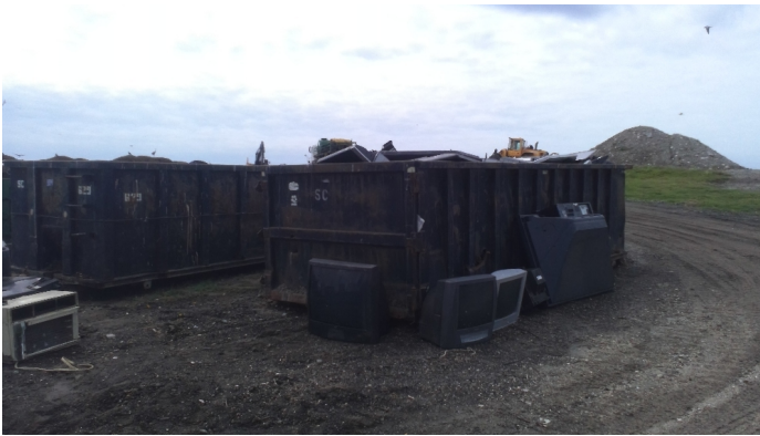
Electronic Waste Storage - During