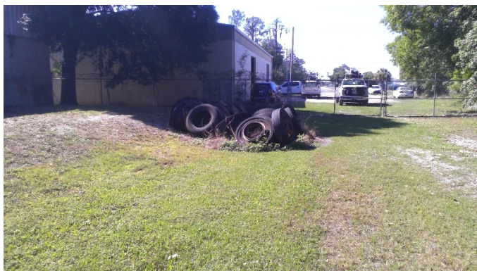
Unauthorized Tire Storage