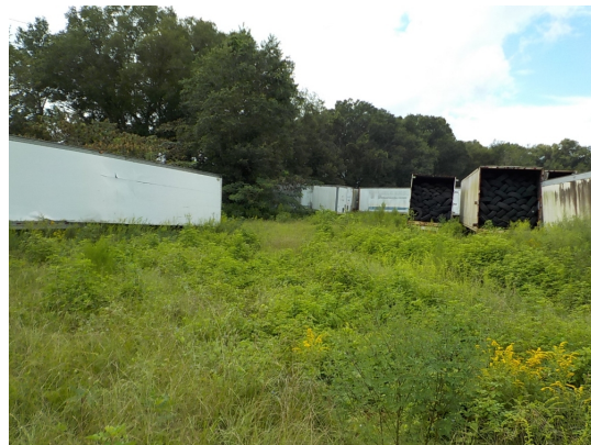
No Fire Lane South Boundary