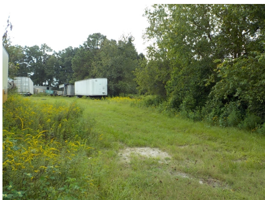
No Fire Lane West Boundary