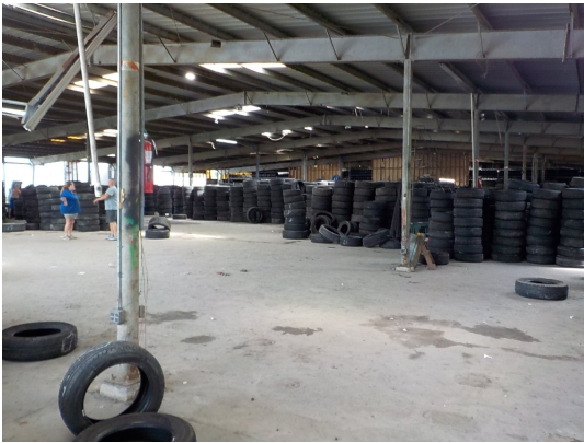
Warehouse Photo 1