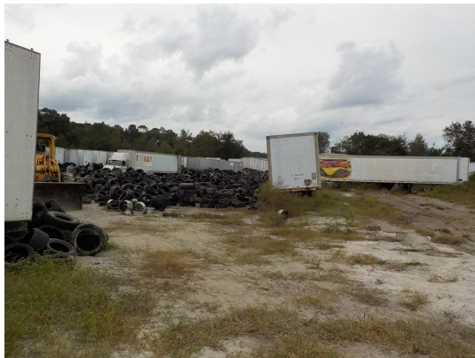
Tires on Ground &amp; No Fire Lane