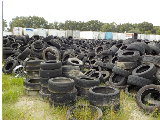
Tires on Ground Photo 1