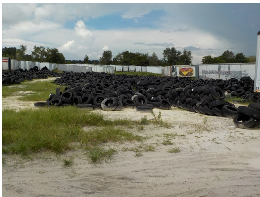
Tires on Ground Photo 2