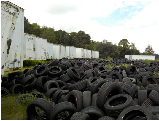
No Fire Lane Trailer Row Photo 2