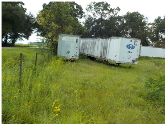
No Fire Lane East Boundary