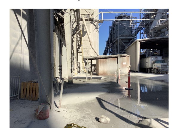
Trailer Staging Area