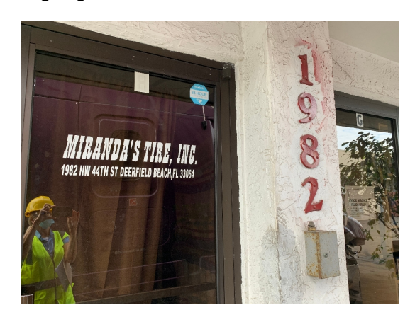
Tires on south wall