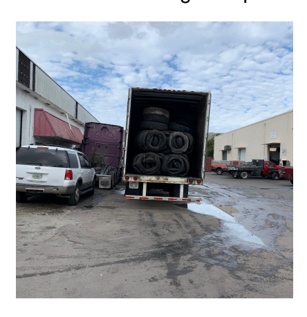
East side of site building