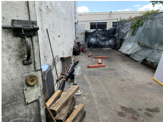
Rear of building