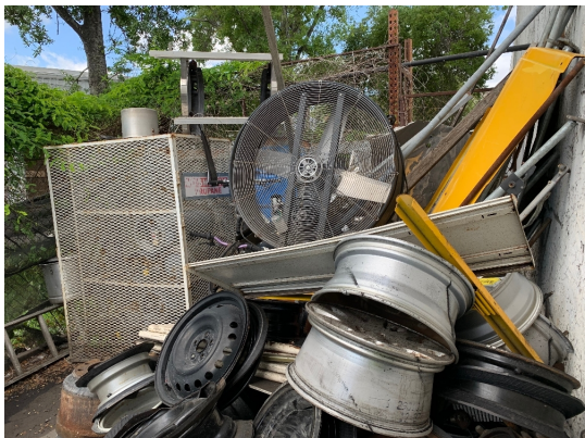
Outside Scrap metal storage