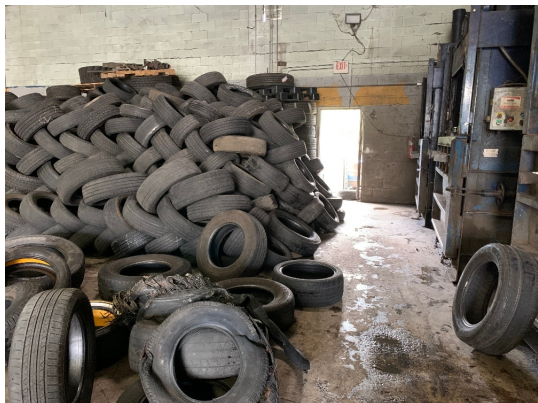
Exit door on S wall