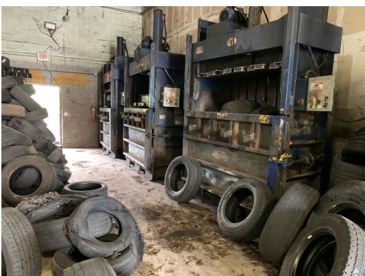
Balers along W wall