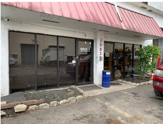
Front of facility with signage