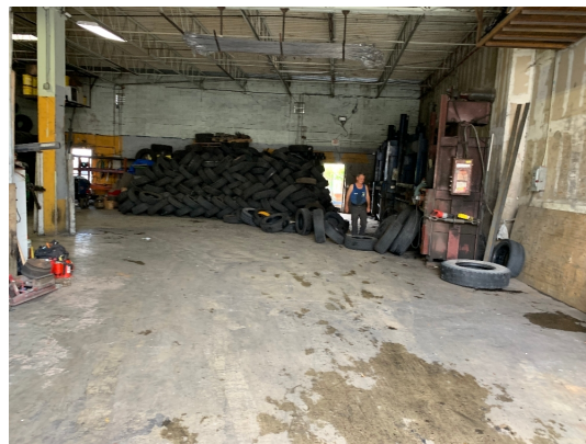
Inside building looking south