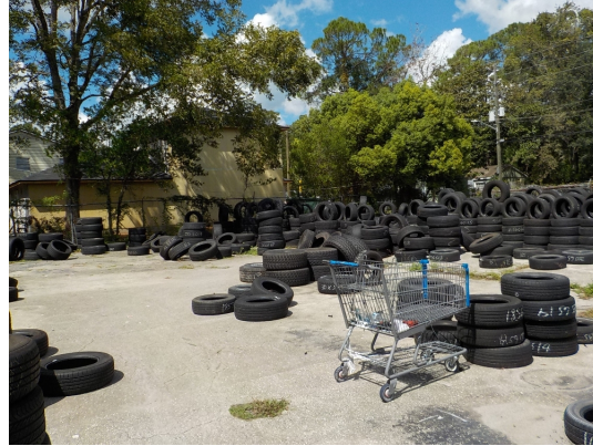
Storage Area 2