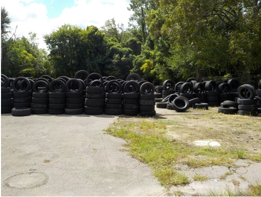
Storage Area 2