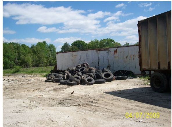
Tires staged on-ground