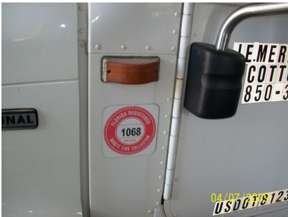
Vehicle showing expired decal