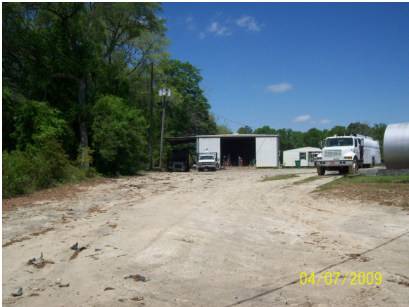
Tire residuals visible @ entrance