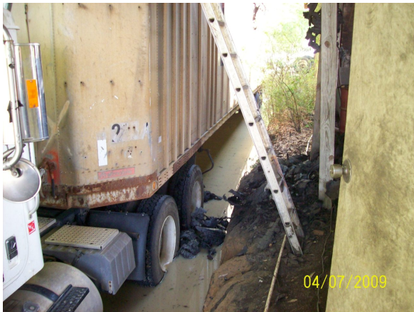
Processed tires in water