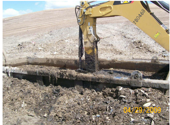
Waste Solidification Area