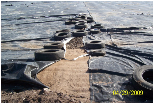
tear in rain cell cover