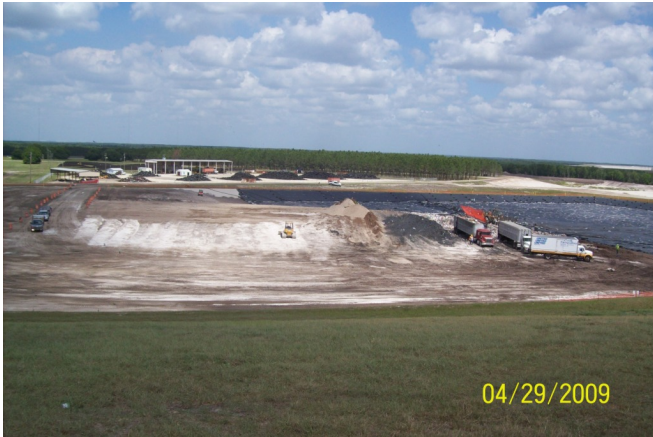
active area (section 9)