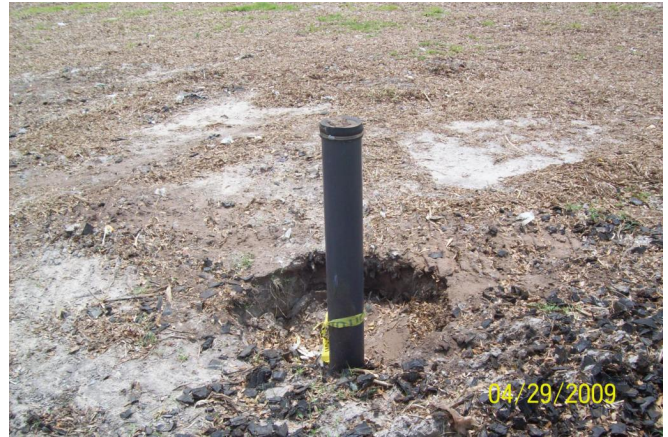
gas well (bentonite contraction)