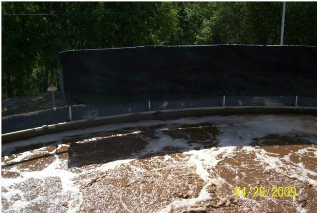
leachate treatment plant "skirt"