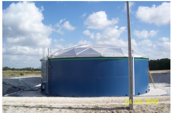
effluent tank construction