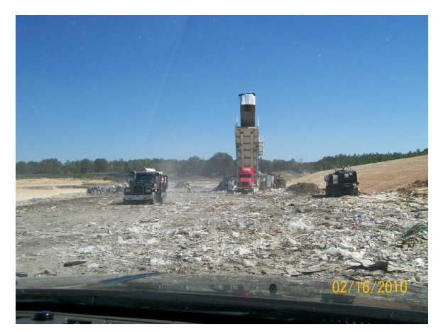
Unacceptable Waste Storage