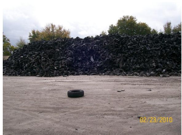
Shredded Tire Pile