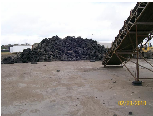
Whole Waste Tire Pile