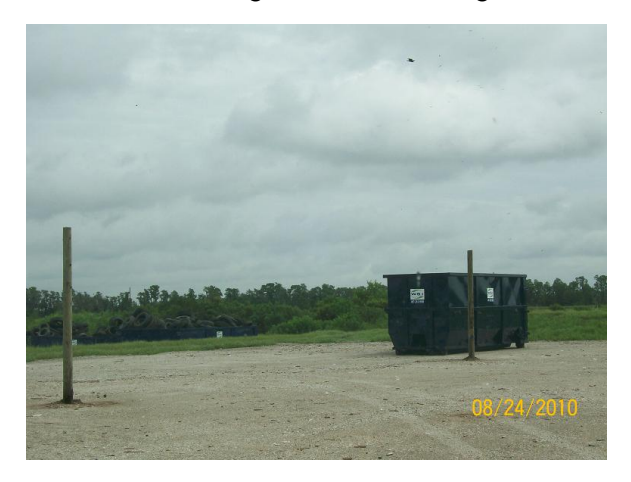
Construction of Auto Fluff Area