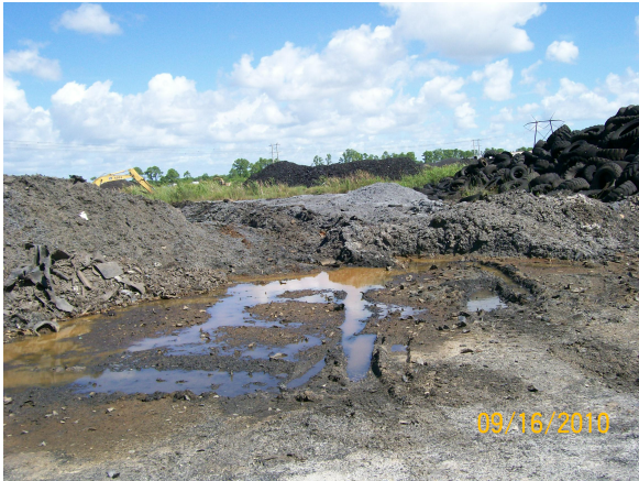
Beginning of fire Area