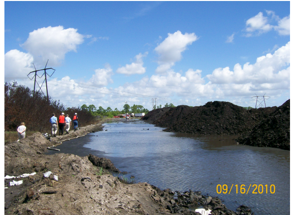
Length of The Tire (burned)