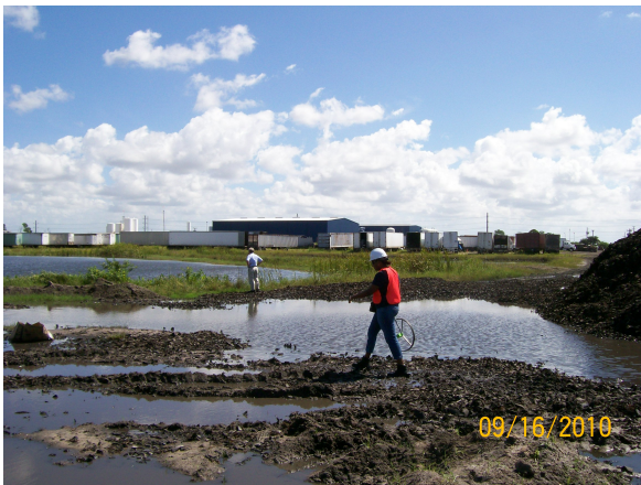
View of Retention Pond