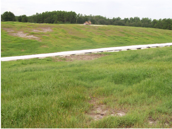
hog damage - S side SW-1