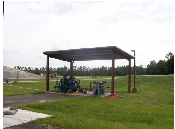
new load-out roof