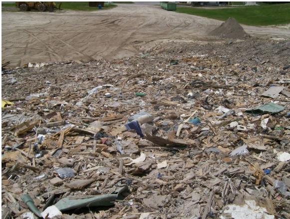
Class III WF