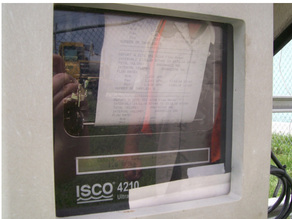
new SW cell flow meter