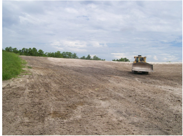
SW-2 active area