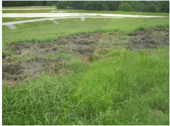
hog damage - N side SW-1