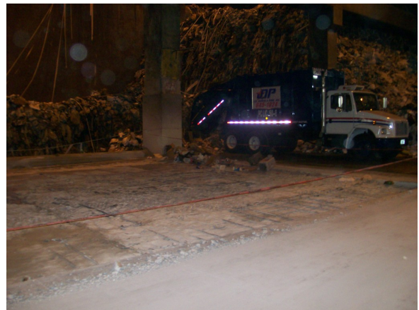
tipping floor repairs