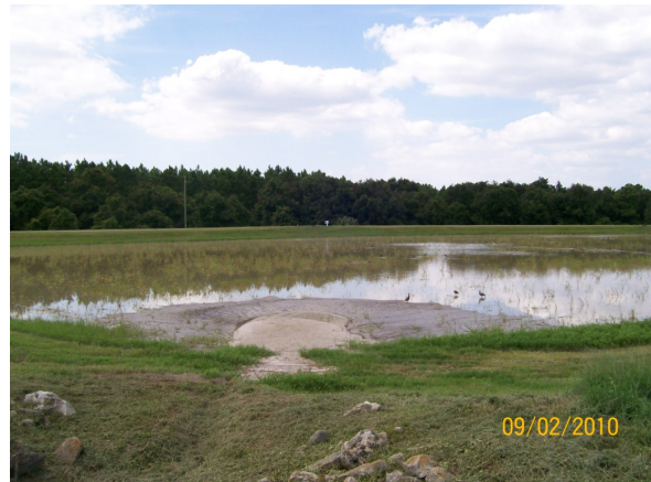
Sediment in pond from erosion