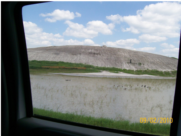
SW corner, Phase I