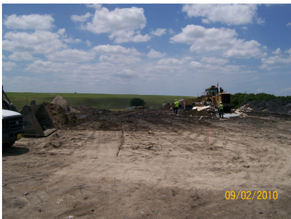
WF, Section 9