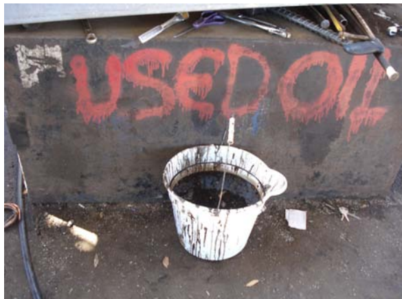
Figure 29 - Used oil container