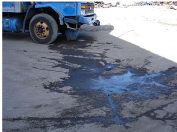
Figure 2 - Antifreeze release