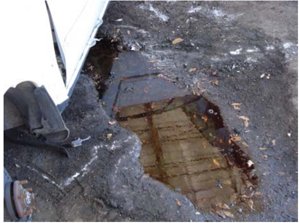
Figure 6 - Auto fluids release