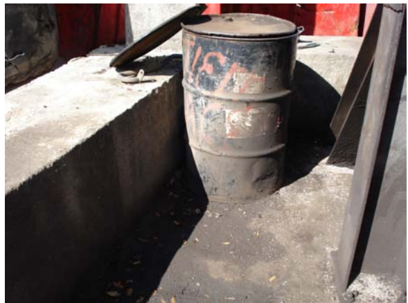
Figure 14- Petroleum impacted soil