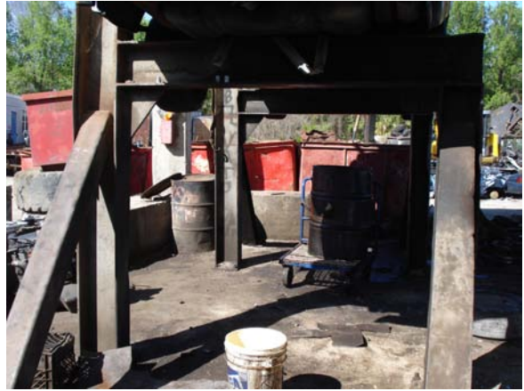
Figure 12 - Pail for waste gas