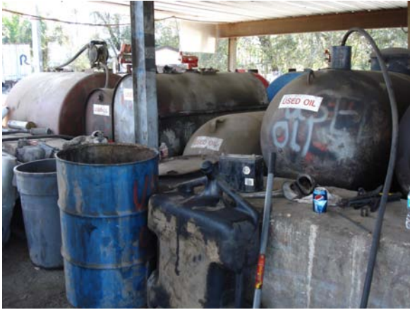
Figure 11 - Storage tanks