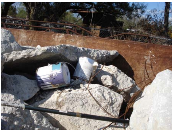
Figure 27 - Waste paint cans