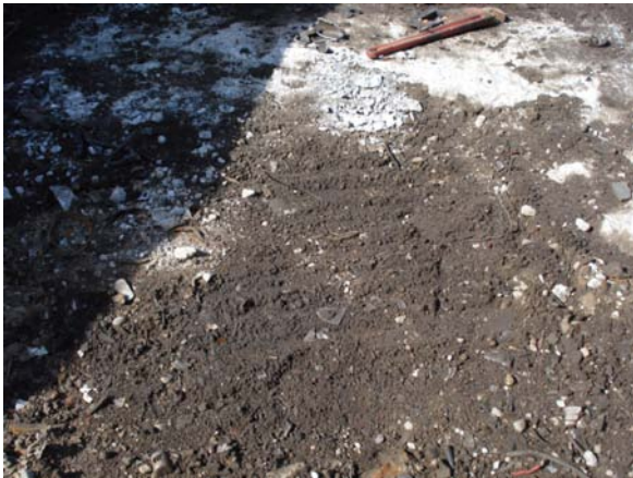
Figure 19 - Petroleum release