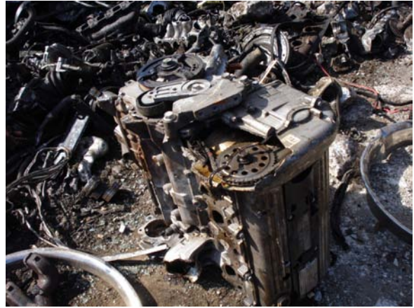
Figure 18-Engine core on ground