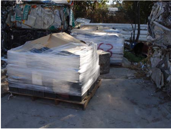
Figure 23-Pallets used batteries