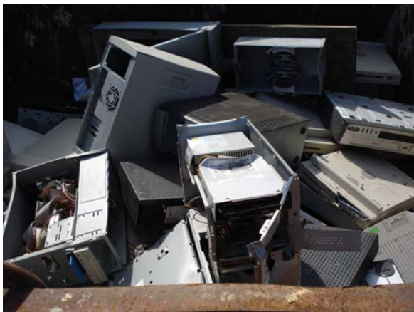
Figure 1 - Waste electronics