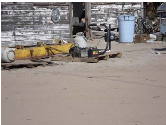
Figure 21 - Used batteries