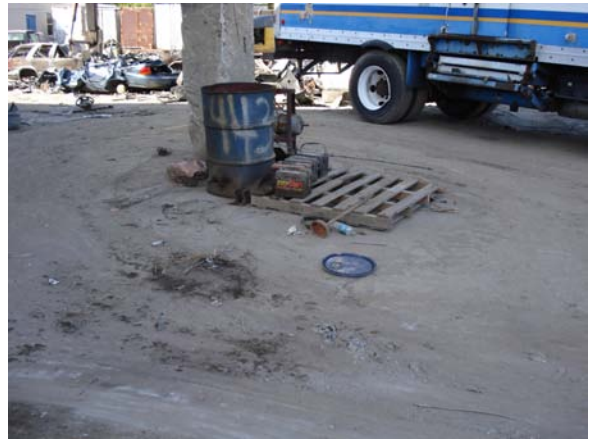
Figure 20 - Used batteries