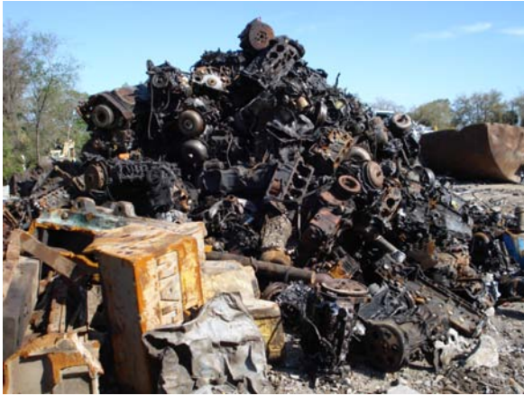
Figure 17-Engine cores on ground