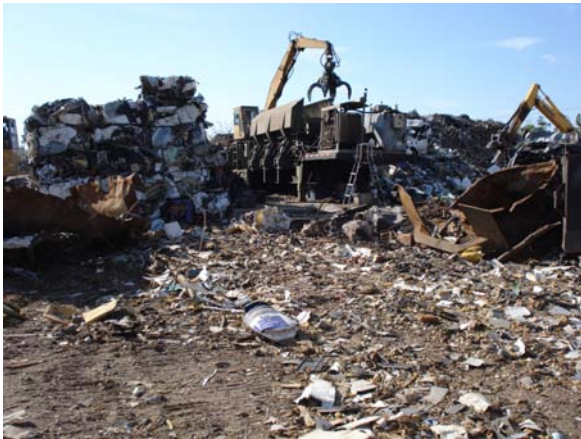
Figure 25-Scrap metal bailer