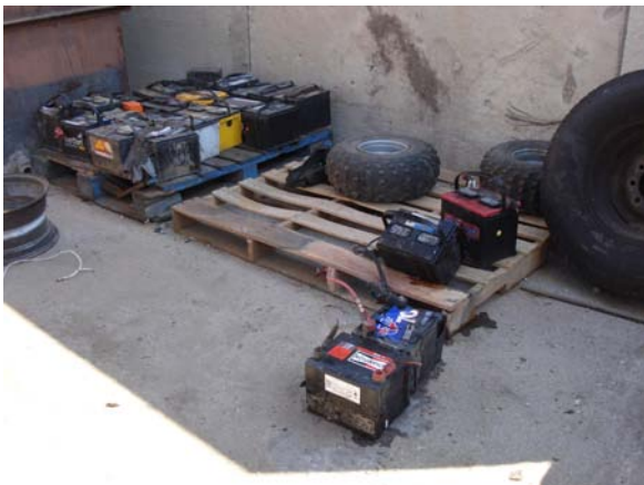
Figure 13 - Used batteries