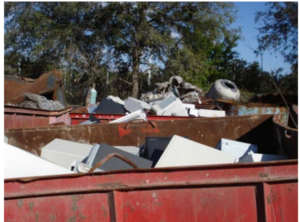
Figure 26 - Waste electronics