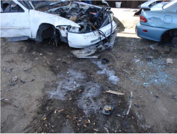
Figure 5 - Auto fluids release