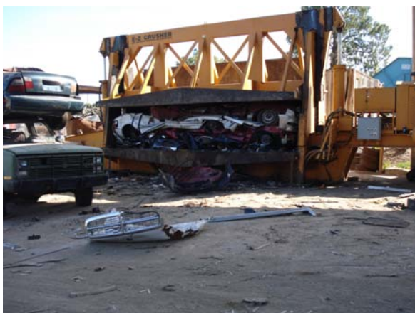
Figure 3 - Auto crusher