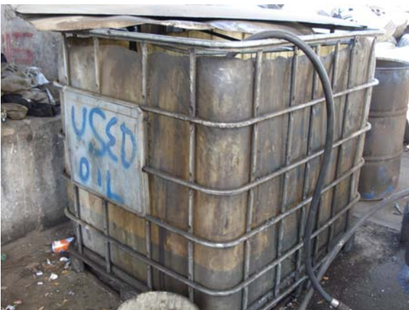
Figure 9 - Used oil tote