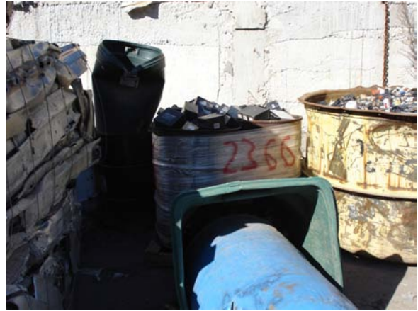
Figure 24 - Drums used batteries