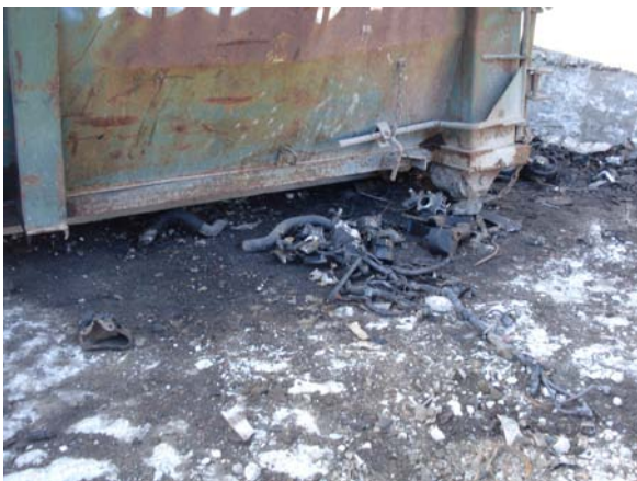
Figure 15 - Petroleum release