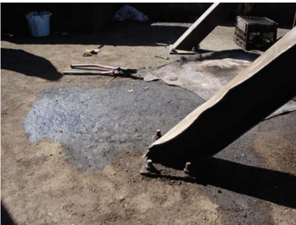
Figure 7 - Auto fluids release