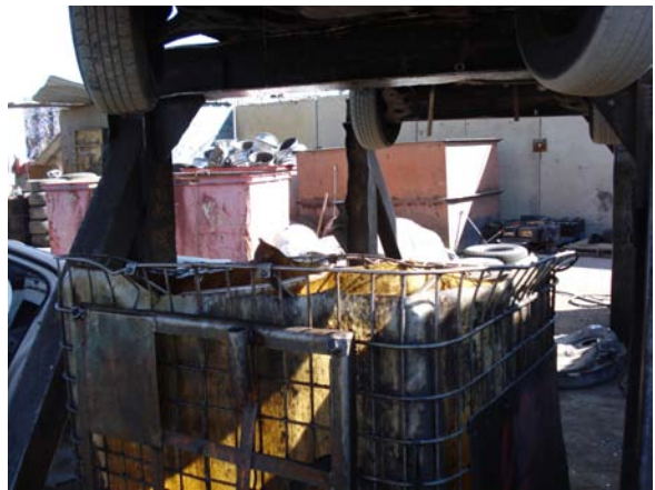
Figure 8 - Used oil tote