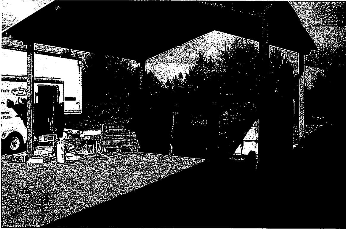
Alachua County HHW Facility