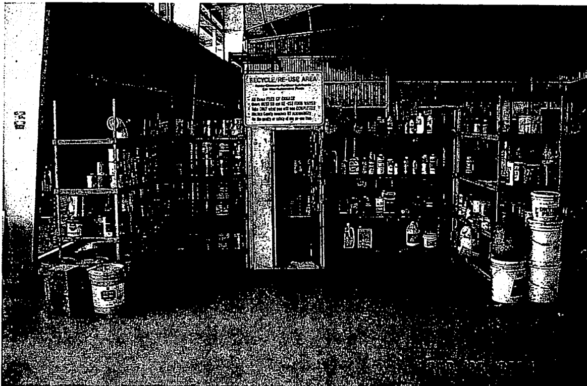
Alachua County HHW Facility