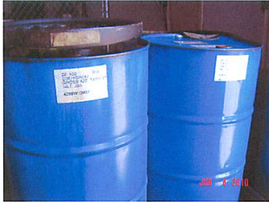
Photo 3 - used oil drums