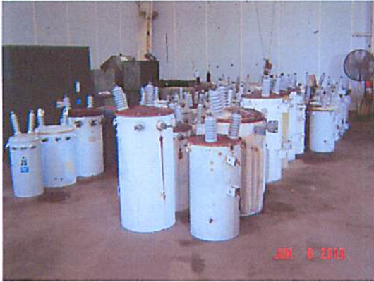
Photo 2 - used oil drums