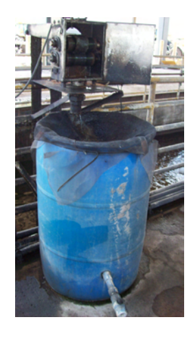
Used Oil Filter Crusher