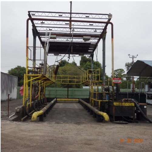
Truck Wash Station