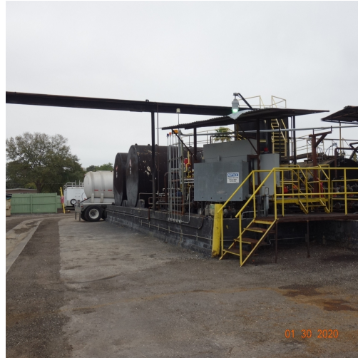
Oil Tank Area (Receiving)