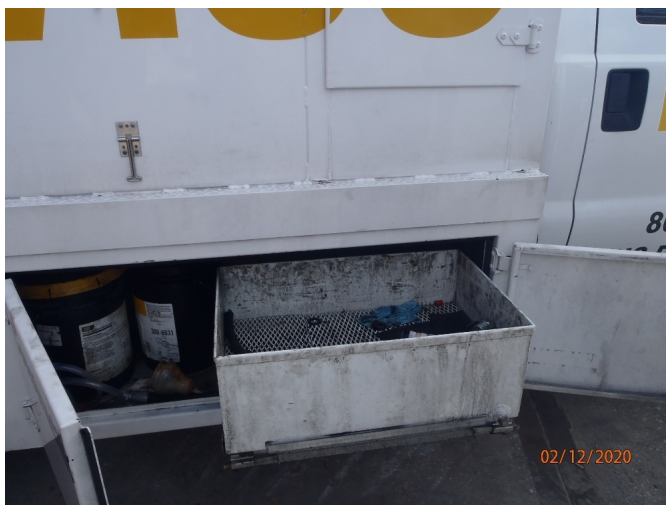
Used oil filter compartment in truck