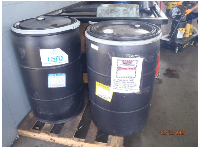
solvent-contaminated wipes drum