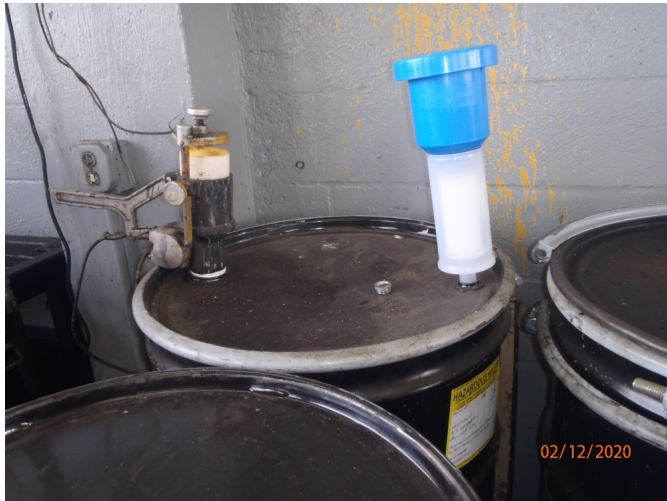
aerosol can crusher