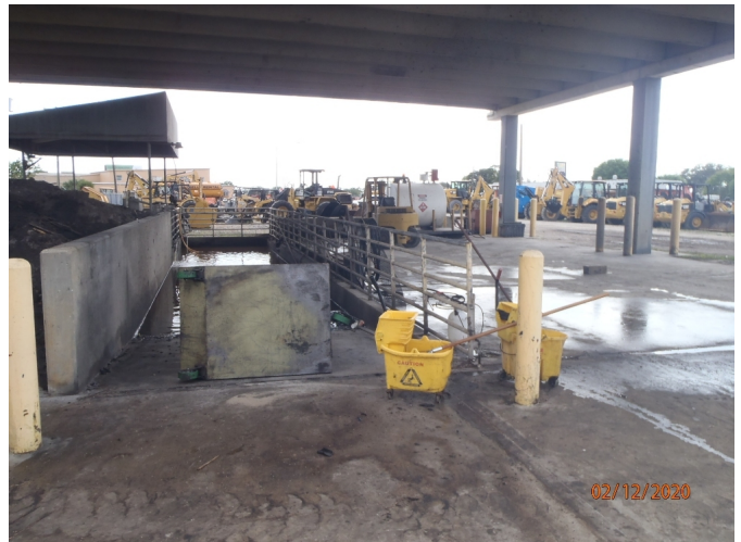
truck wash area