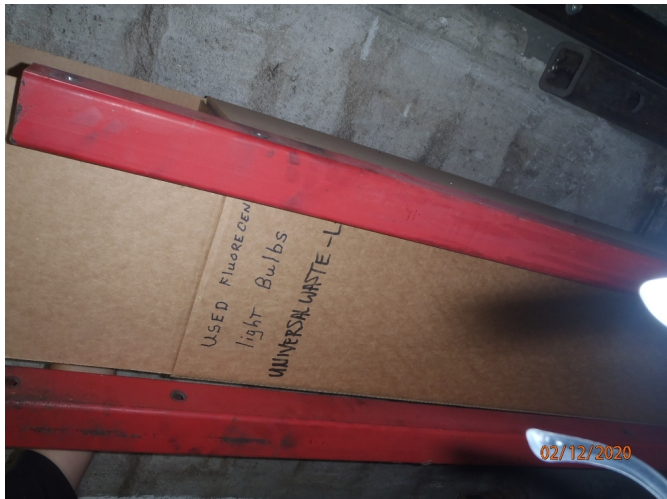
spent fluorescent lamps